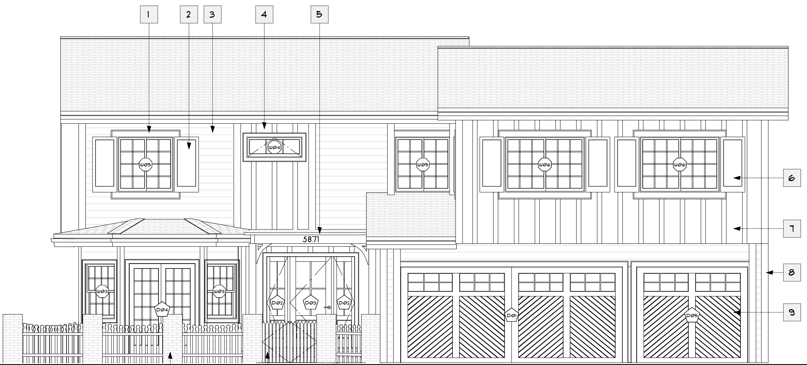
(E) SOUTH ELEVATION